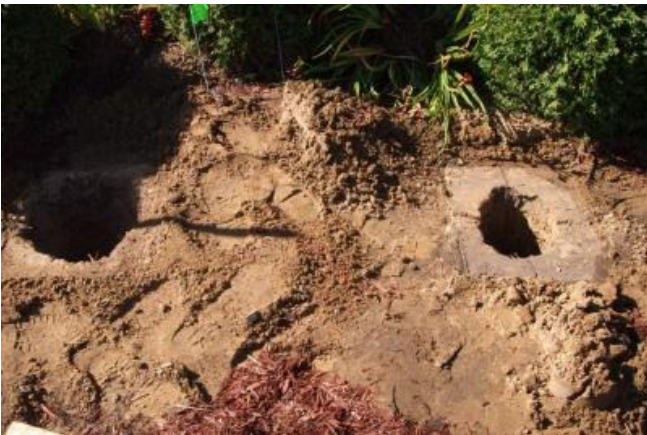
7. Dig your 2 holes spaced accordingly for your post bottoms.