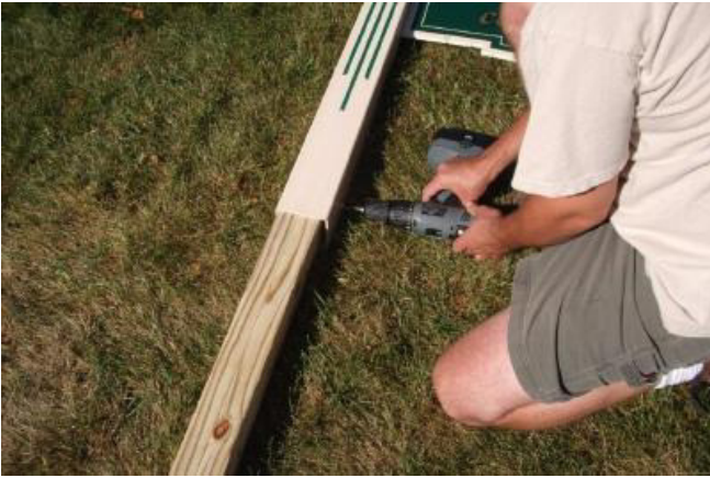
6. Pre-drill holes on inside of sign posts near bottom. Insert stainless steel screws.